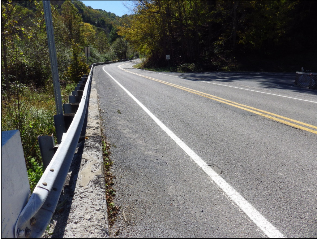
Photograph 3. Matoaka Bridge No. 2, Arista Mountain Road, facing southwest at newel post on upstream side of the bridge.