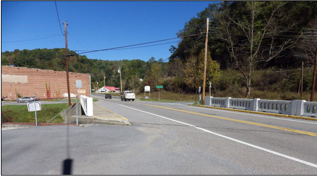
Photograph 1. Matoaka Bridge No. 2, through view of spandrel parapet walls, newel posts, and First Avenue travel lanes, facing northeast.