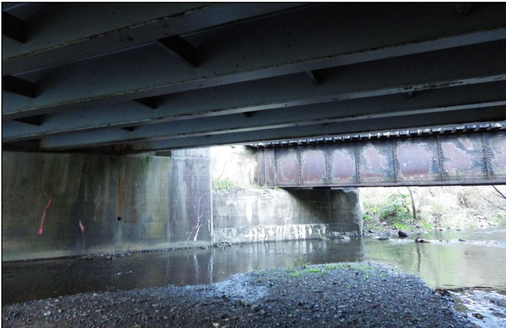
Photograph 8. Matoaka Bridge No. 2, view of steel stringers, braces, abutment, adjacent Bluestone Branch (MC-1926) Bridge No. 2903, and Widemouth Creek, facing northeast.