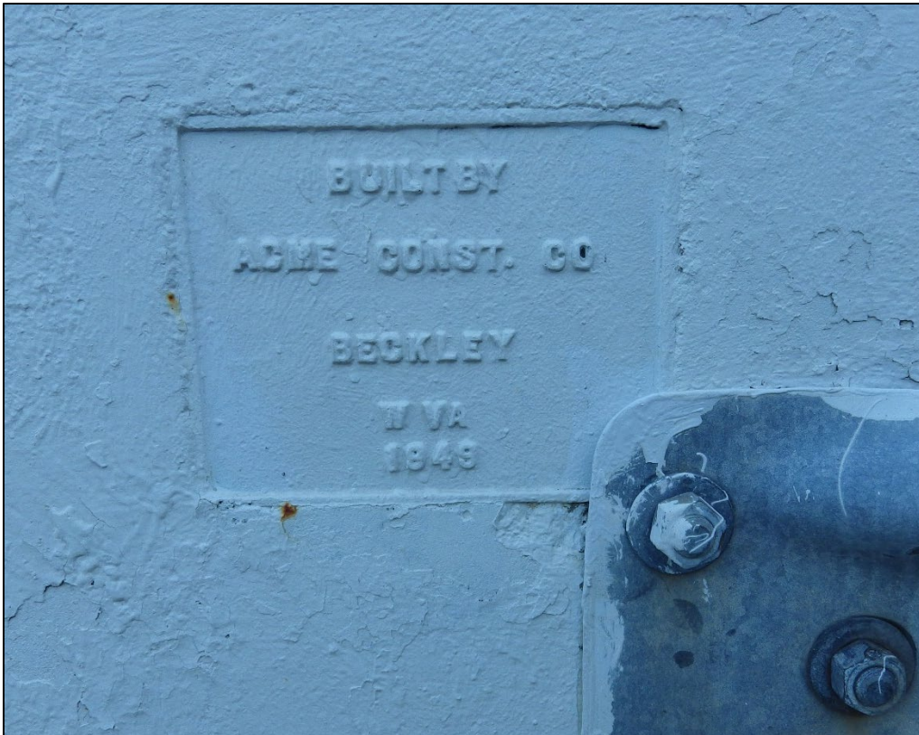
Photograph 10. Matoaka Bridge No. 2, view of bridge builder's plaque, facing southeast.