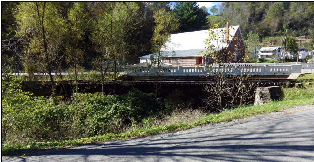
Photograph 4. Matoaka Bridge No. 2, from Old Matoaka Road, dis-used railroad bridge of the Bluestone Branch (MC-1926), spandrel parapet wall, and The Bridge Baptist Church (MC-0132) in the background, facing northwest toward Bailey Street.