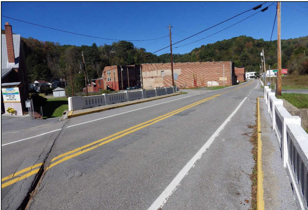
Photograph 2. Matoaka Bridge No. 2, through view of First Avenue toward Barger Street commercial area, parapets, newel posts, sidewalk, and travel lanes, facing north.