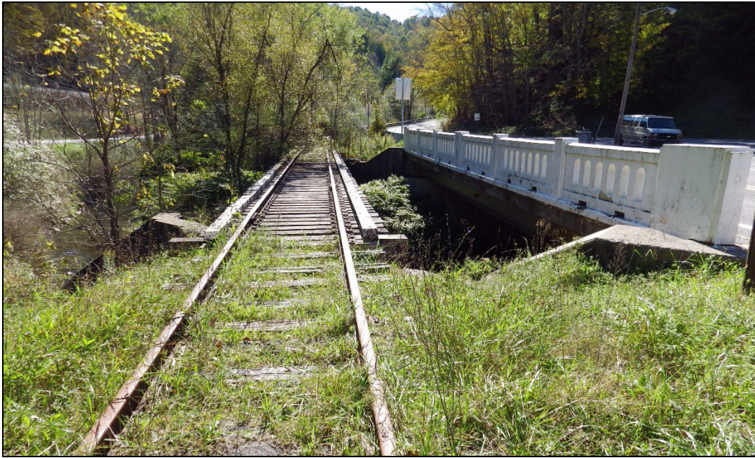
Photograph 5. Matoaka Bridge No. 2, and Bluestone Branch (MC-1926) rails and Bridge No. 2903, facing southwest.