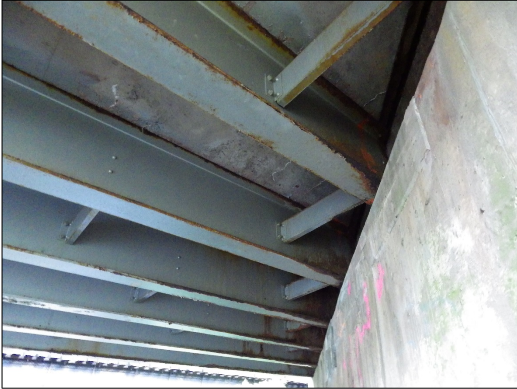
Photograph 9. Matoaka Bridge No. 2, view of steel stringers and bracing at south abutment, facing southeast.