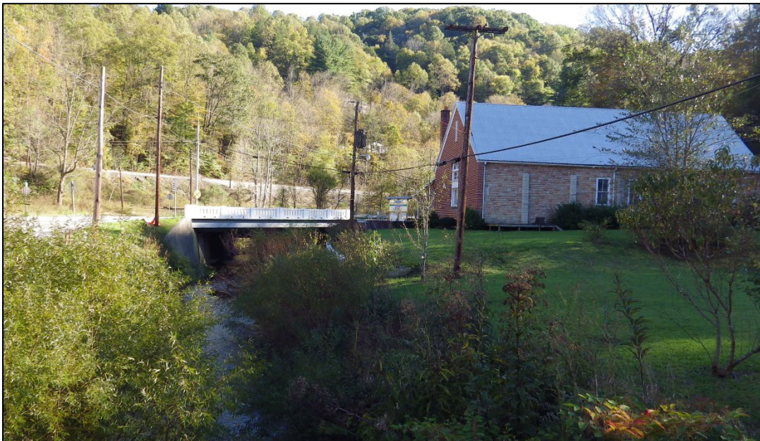
Photograph 6. Matoaka Bridge No. 2, downstream view from Bailey Street Bridge, The Bridge Baptist Church (MC-0132), facing south of southeast.