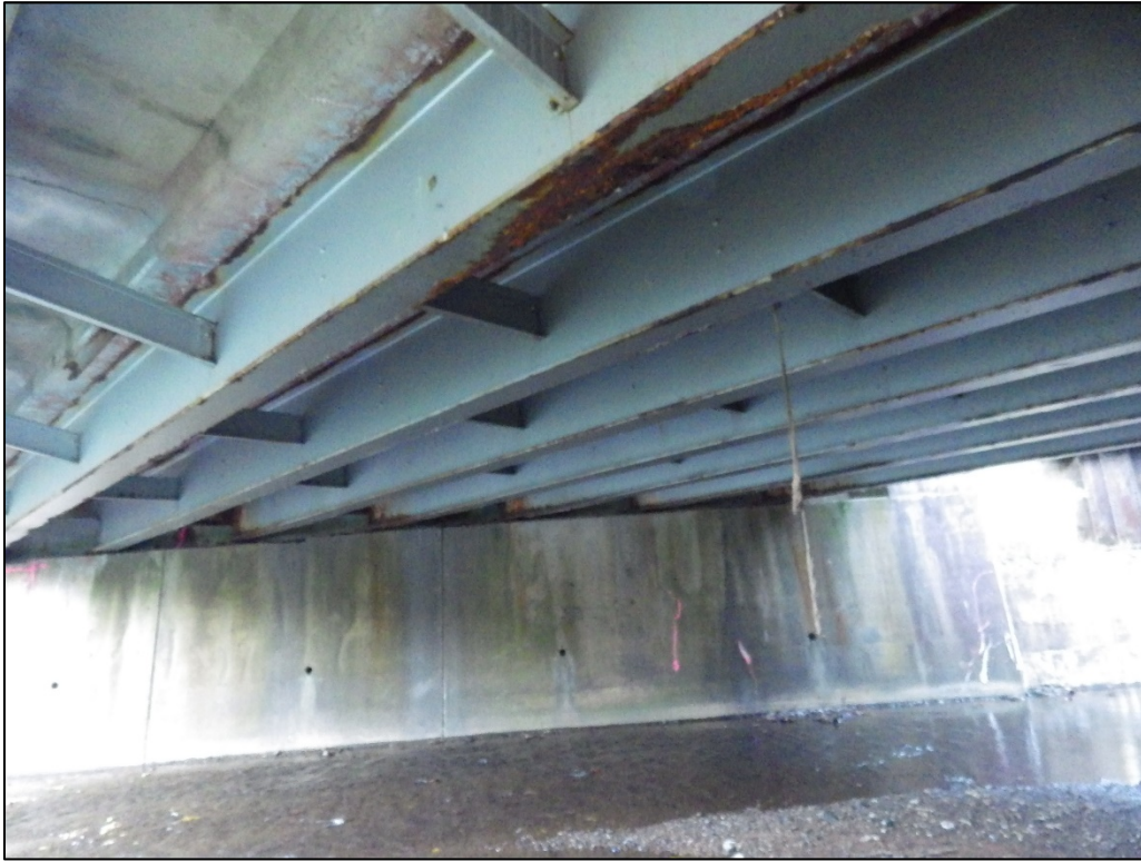
Photograph 7. Matoaka Bridge No. 2, view of steel stringers, braces, abutment, underside of deck, and Widemouth Creek, facing northeast.